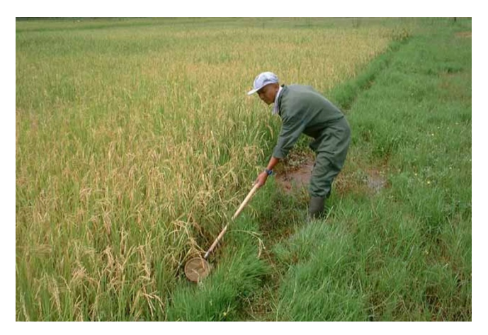
Figure 4 Illustration of the net method.