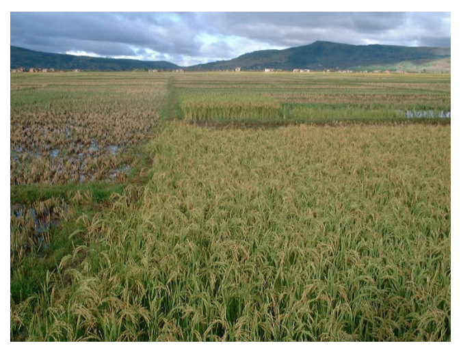
Figure I General view of rice fields at the end of rainy season in Madagascar.